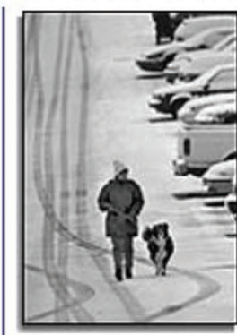
Snowy Walk Washington area roadways are reported to be mostly clear today after Thursday's snow. Another light snowfall is expected tonight.